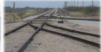
Rail Transportation Consulting