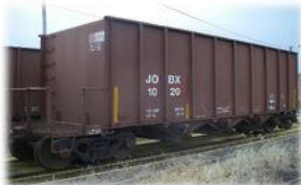
Railcar Leasing & Sales

Specializing in Rail Transportation Solutions