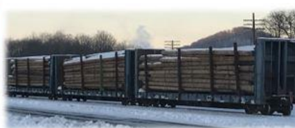
Rail Fleet Management Services