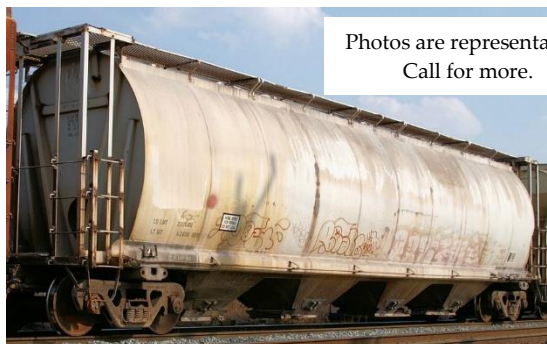
Photos are representative. Call for more.